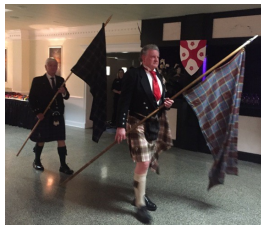
An event rich in family ties, Scottish food, music, and fellowship!

Our friends at The Scottish Trading Company will tailor a kilt in your choice of tartan if you hold the winning raffle ticket.