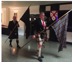
An event rich in family ties, Scottish food, music, and fellow-

The musical entertainment this year is Keltricity . They have performed at a broad range of prominent area venues and will bring a fresh musical perspective to respected traditions on the fiddle, mandolin, piano, guitar and accordion.