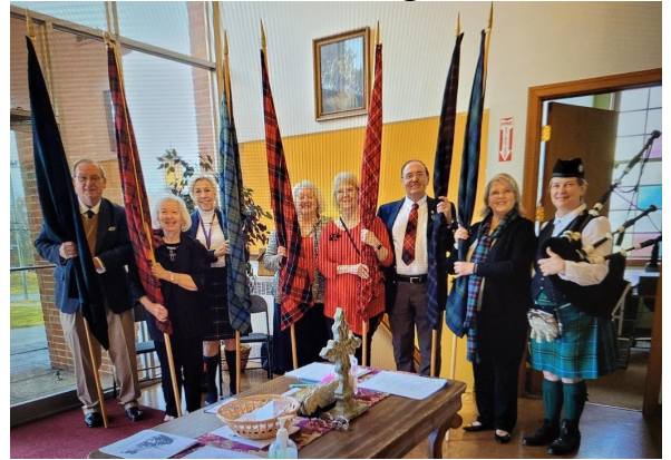
Kirking flag volunteers at Okolona, courtesy of Linda Montgomery