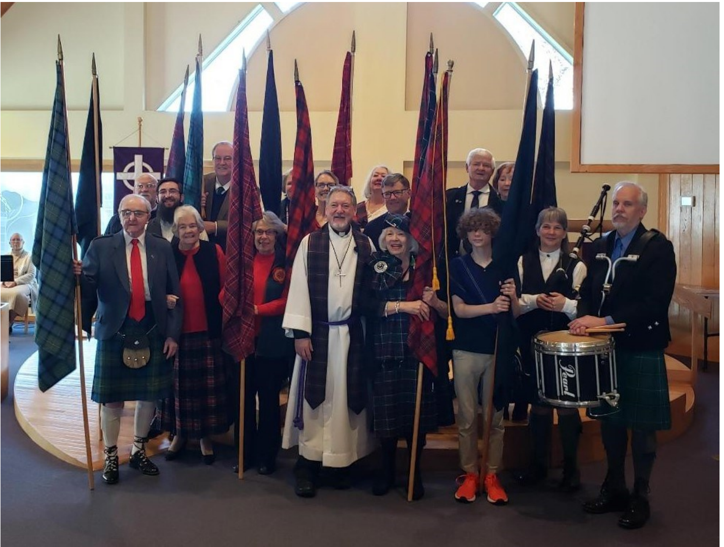
March 17th Kirking group photo at Ascension Lutheran Church